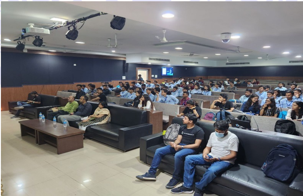
Fig.11: Group photo after a placement drive