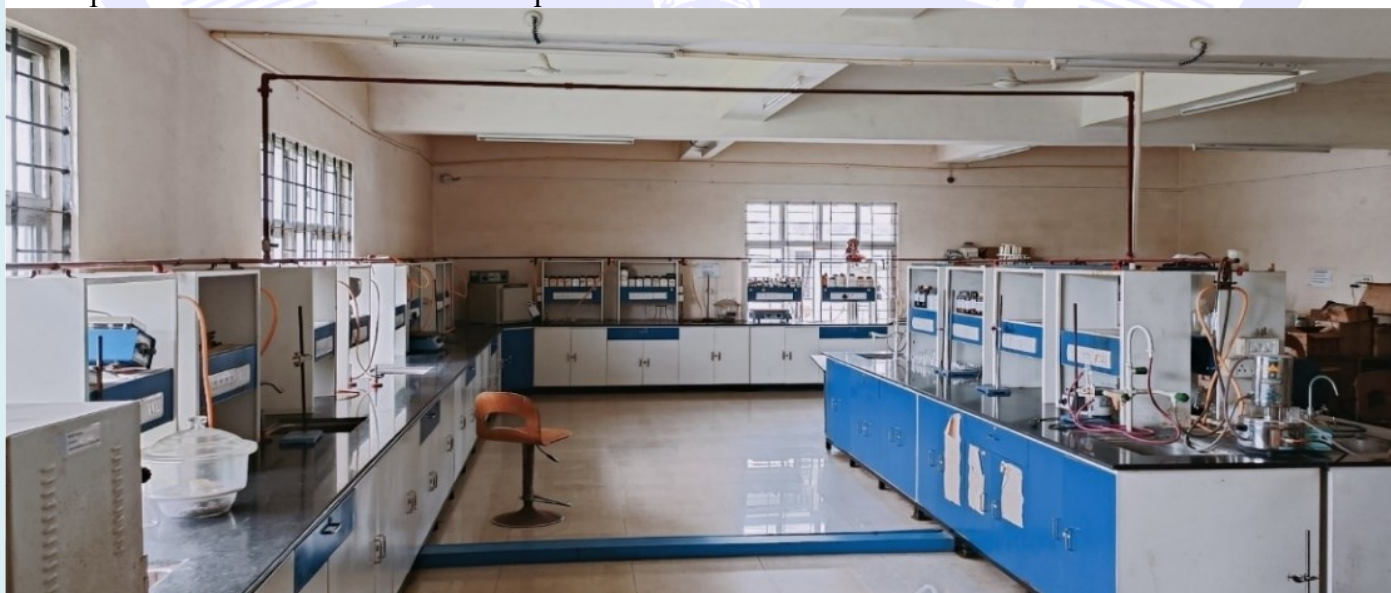
Fig.6: One of the Laboratory of the Department of Applied Sciences

The Department of Applied Sciences was established in 2014 by merging three erstwhile Departments of Physical Science, Chemical Science, and Mathematical Science. Presently the department is offering Five Year Integrated Master's Program (FYIMP) in Applied Science with specialization in Chemical Science, Physical Science and Mathematical Science and Doctor of Philosophy (Ph.D.) in Chemical Science, Physical Science and Mathematical Science respectively. Moreover, the department is dealing with the core compulsory, common, and science elective courses of the B.Tech. in BT, ECE and IT programs. The Department has faculty members in different fields of Chemical, Physical and Mathematical Sciences. Students from the Department have been undertaking their curriculum projects in different international, national institutes and centres of repute. Most of the former students of the department are placed in government and public sector jobs and many are pursuing higher studies in reputed institutes of the country and abroad. The departmental faculty members are also actively involved in research works, both theoretical and experimental in collaboration with reputed national and international institutes.