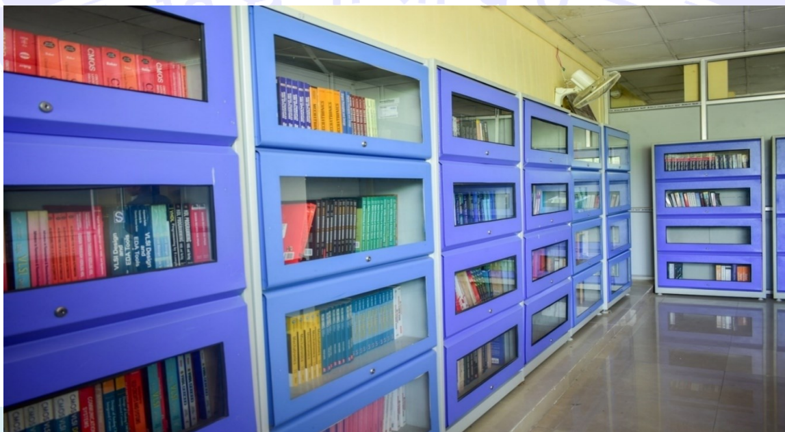
Fig. 3: GUIST Library

7 seats in B.Tech. programme are reserved for other North Eastern states: 1 seat for each of the states of North East other than Assam. The candidates seeking admission under this category needs to contact the respective State's Directorate of Higher Education/Technical Education.