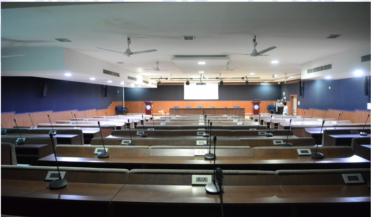
Fig.4: GUIST Seminar Hall

Hostel Facilities: Hostel seats shall be provided in the University hostels depending on the availability.