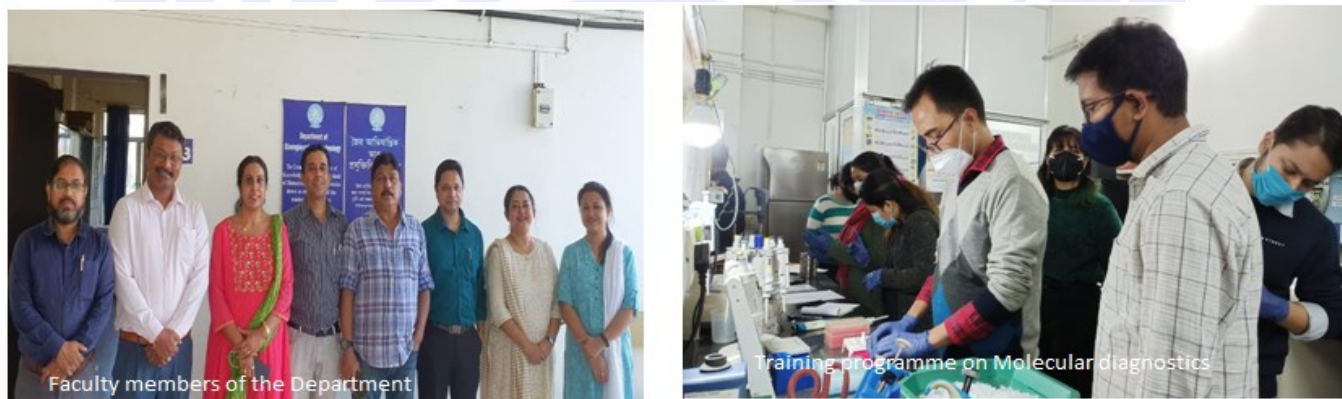
Fig.8: Faculty members of the Department of Bioengineering and Technology(left) one of the laboratory of Department of Bioengineering and Technology(Right)

All Department classrooms are ICT enabled. The Department has an internet-connected computer lab. Bioengineering students and researchers can conduct experiments smoothly in modern labs. High-end facilities ensure quality research. Such facilities include FACS, Microbial Identification System, Multimode plate reader, High Performance Computer, ACTA Start Protein purification system, Ultra-Sonicator, Fluorescence Microscope, GC-MS, GC, HPLC, etc. These departmental facilities complement the high-quality research projects received from DBT, DST, ICMR, AICTE, and others by various bright faculty members. The Department has well-established animal as well as plant cell culture facilities.