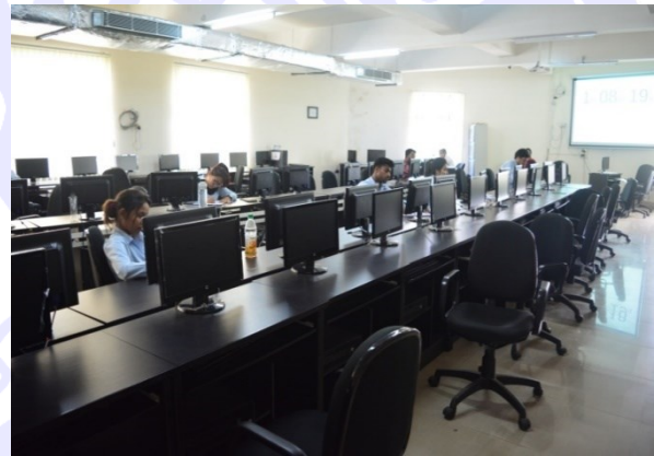
Fig.10: Department of Information Technology