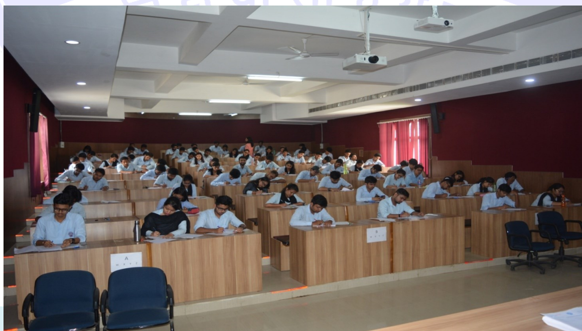
Fig.2: One of Gallery of GUIST