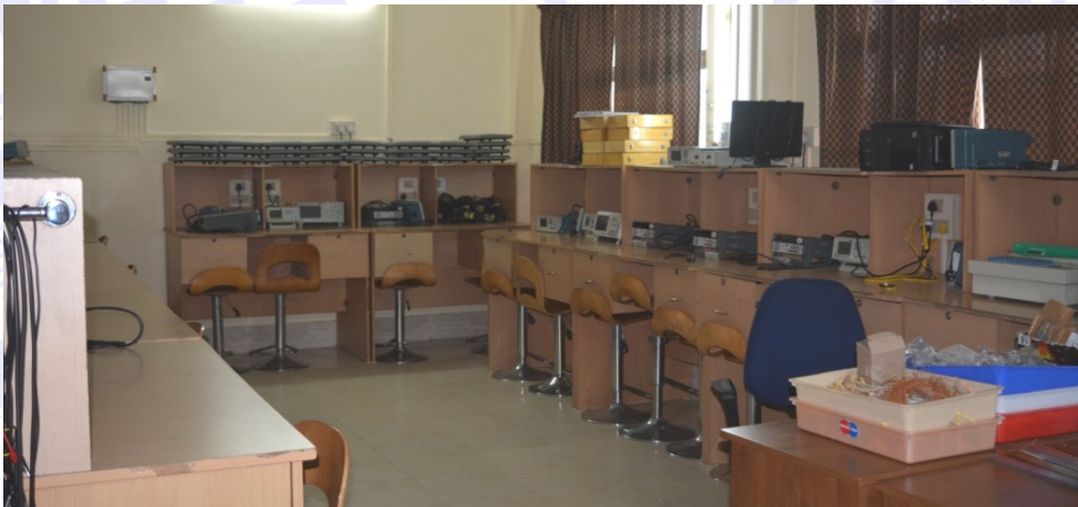
Fig10: Laboratory in the Department of Electronics and Communication engineering

Electronics and Project Lab: It has provisions for about 50 students. It is mainly intended to run lab courses of first three years of the B.Tech. programme. It has regulated DC power supplies, CROs, DSOs, Function generators etc. suitable upto 10 MHz and a few DSOs up-to 20 MHz. The Project Lab has provisions for advance design and project works supporting upto 50 students. It is equipped with DDS function generators, DSOs, power supplies etc. It also has computers for interfacing, simulation, software-based design and fabrication etc.