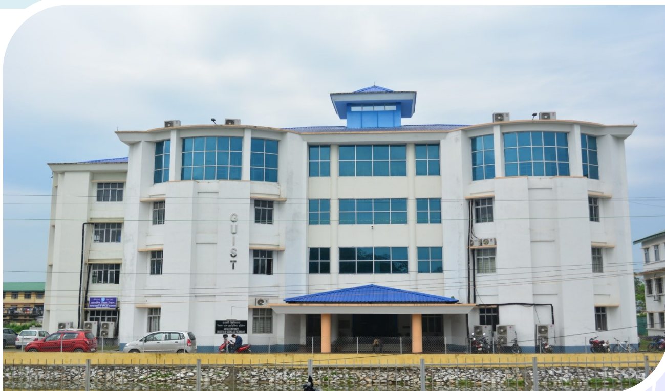
Fig.1: GUIST New Academic Building

Admission process for B.Tech., and B.Tech. (Lateral) programme offered at Gauhati University Institute of Science and Technology for the session 2024-25 is in the process.