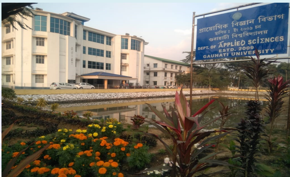
Fig.5: Department of Applied Sciences

The Department of Applied Sciences was established in 2014 by merging three erstwhile Departments of Physical Science, Chemical Science, and Mathematical Science. Presently the department is offering Five Year Integrated Master's Program (FYIMP) in Applied Science with specialization in Chemical Science, Physical Science and Mathematical Science and Doctor of Philosophy (Ph.D.) in Chemical Science, Physical Science and Mathematical Science respectively. Moreover, the department is dealing with the core compulsory, common, and science elective courses of the B.Tech. in BT, ECE and IT programs. The Department has faculty members in different fields of Chemical, Physical and Mathematical Sciences. Students from the Department have been undertaking their curriculum projects in different international, national institutes and centres of repute. Most of the former students of the department are placed in government and public sector jobs and many are pursuing higher studies in reputed institutes of the country and abroad. The departmental faculty members are also actively involved in research works, both theoretical and experimental in collaboration with reputed national and international institutes.