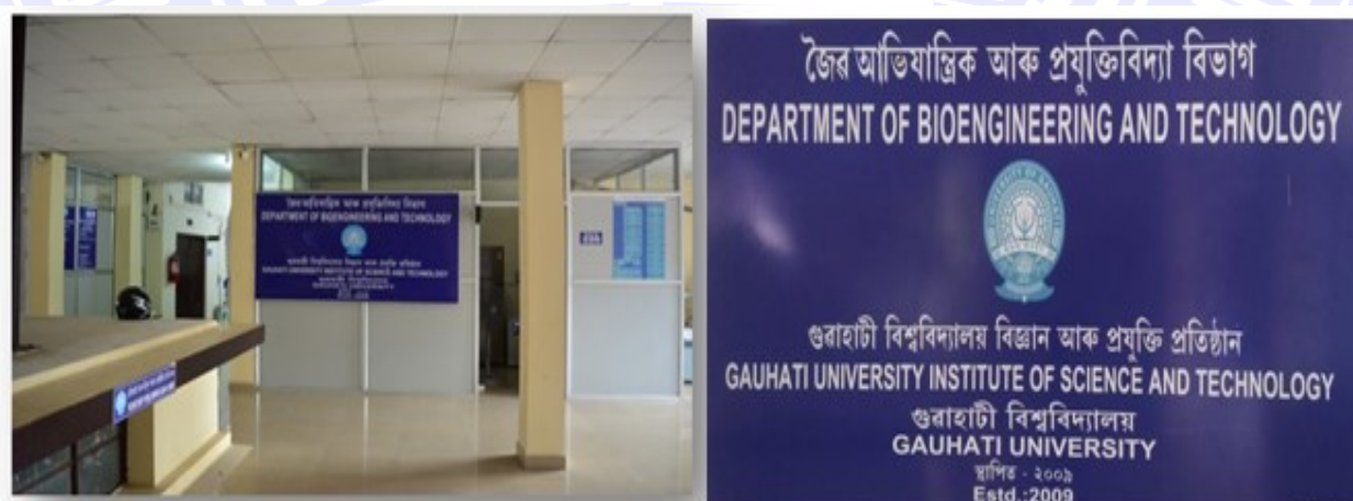
Fig.7: Department of Bioengineering and Technology