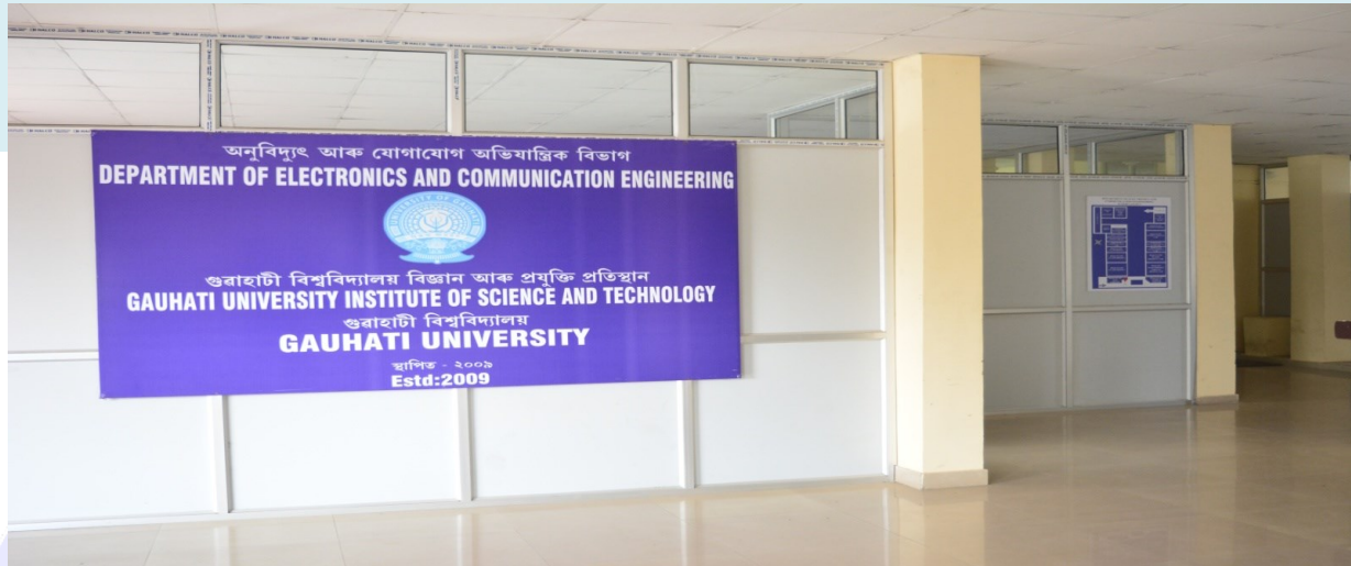
Fig.9: department of Electronics and Communication Engineering