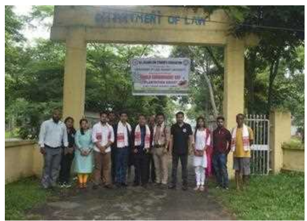
World Environment Day 2022