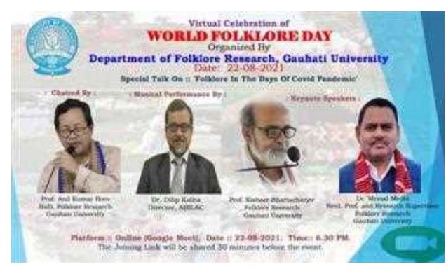
World Folklore Day 2022