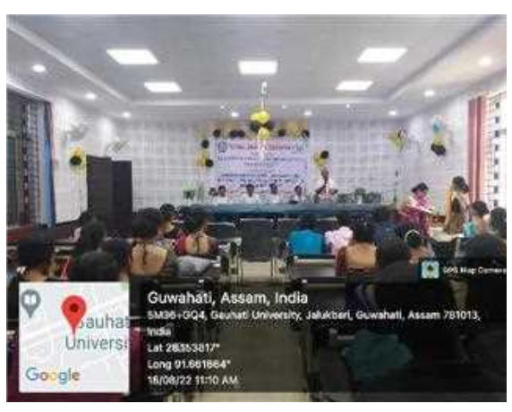
National Library Day 2022