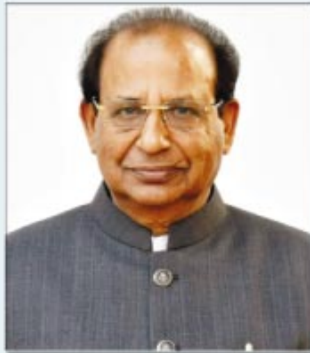
Professor Jagdish Mukhi Chancellor, Gauhati University & Hon'ble Governor of Assam