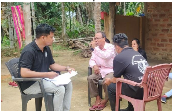
Learning from the community perspective