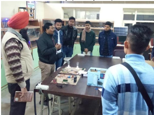
Industrial visit by the B.Tech students