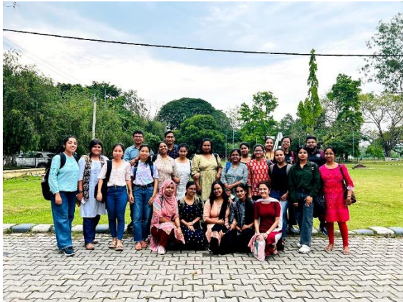
Students on exposure visit

Photographic evidence of conducting special programs catering differential learning needs of students