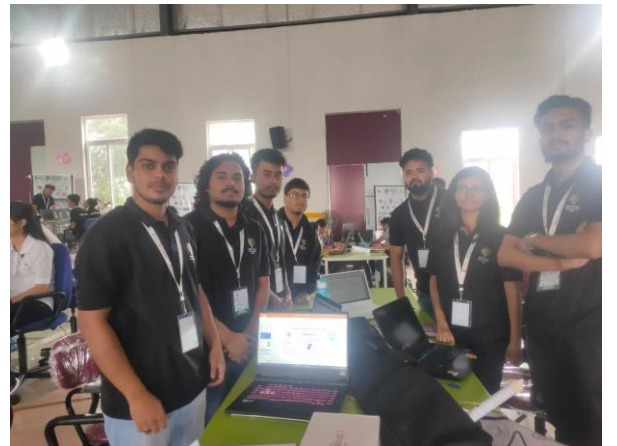
Smart India Hackathon 2022