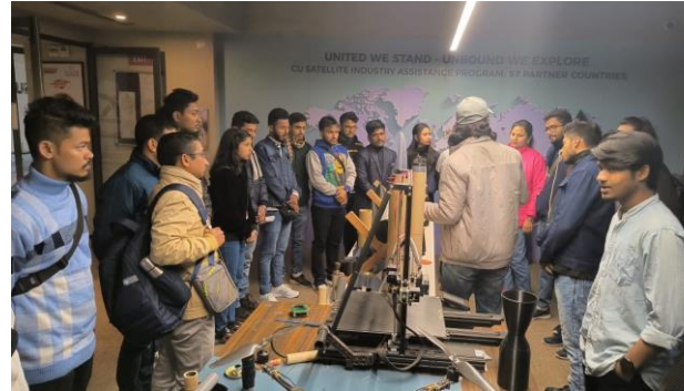
Students participating in the finals of Smart India Hackathon 2022