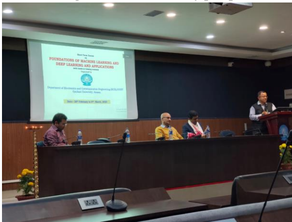
Programs on Maching learning applications