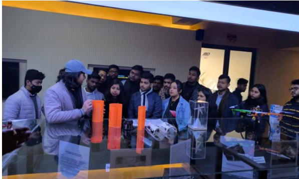
Industrial Visit of our Final year B.Tech. Students to SCL Chandigarh, CSIO Chandigarh and Chandigarh University. (January 2023)

Industrial visits and exposure to advanced level technological events