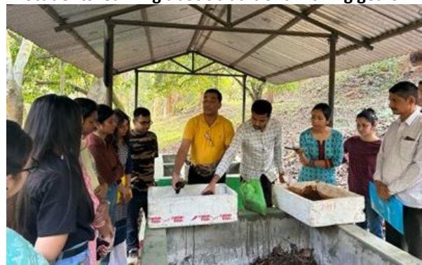
Hand on training on vermicomposting