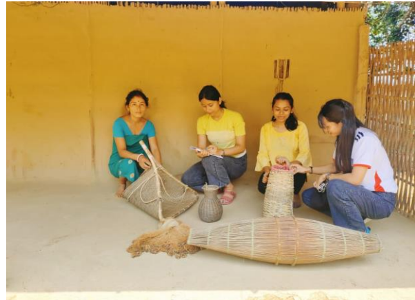
Students learning about traditional fishing gears