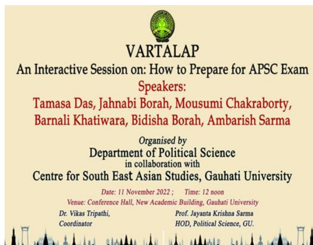
An Interactive Session on How to Prepare for APSC Exams with successful APSC candidates from the Department on 11th Nov 2022