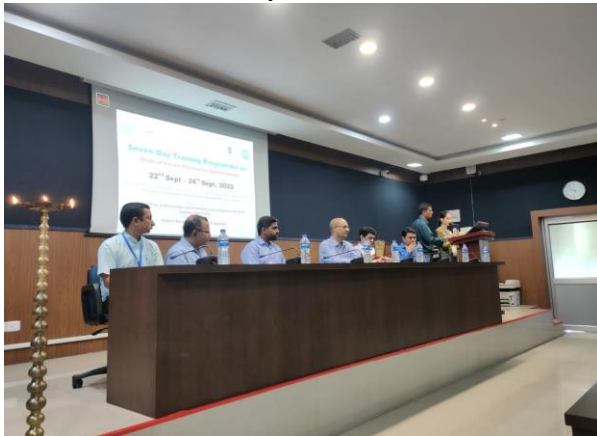
A 7 day long training program on "State of the Art Electronic System Design" under STUTI scheme of DST, Govt. of India, from 22nd to 28th September, 2022